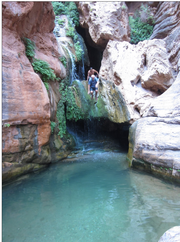
Figure 11. Jumping off the waterfall at Elves Chasm.