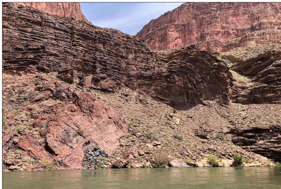
Figure 9. Fold in the sedimentary rock.

Sedimentary rock layers in the Grand Canyon are sometimes folded or bent, especially near fault lines. How could rock bend but not break? After all, when earthquakes happen today, rocks do not bend; they break because they are brittle. Heat and pressure can certainly bend rock, but that alters the rock's internal makeup, and the makeup of these layers was not altered according to geological research. A better explanation is that the rock was bent while still soft and pliable, soon after deposition—a rapid and deep deposition.