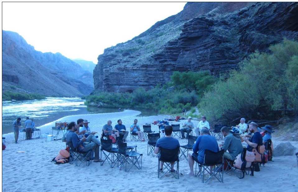
Figure 15. Food and conversation at Football beach.

As I looked at the canyon walls around every twist and turn, it impressed me that there was little or no evidence of erosion between the horizontally laid rock layers. If the boundaries between one layer and another represent millions of years, why didn't I see evidence of erosion?