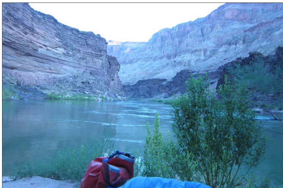
Figure 14. View from my sleeping bag at sunrise. There's nothing quite like sleeping under the stars.