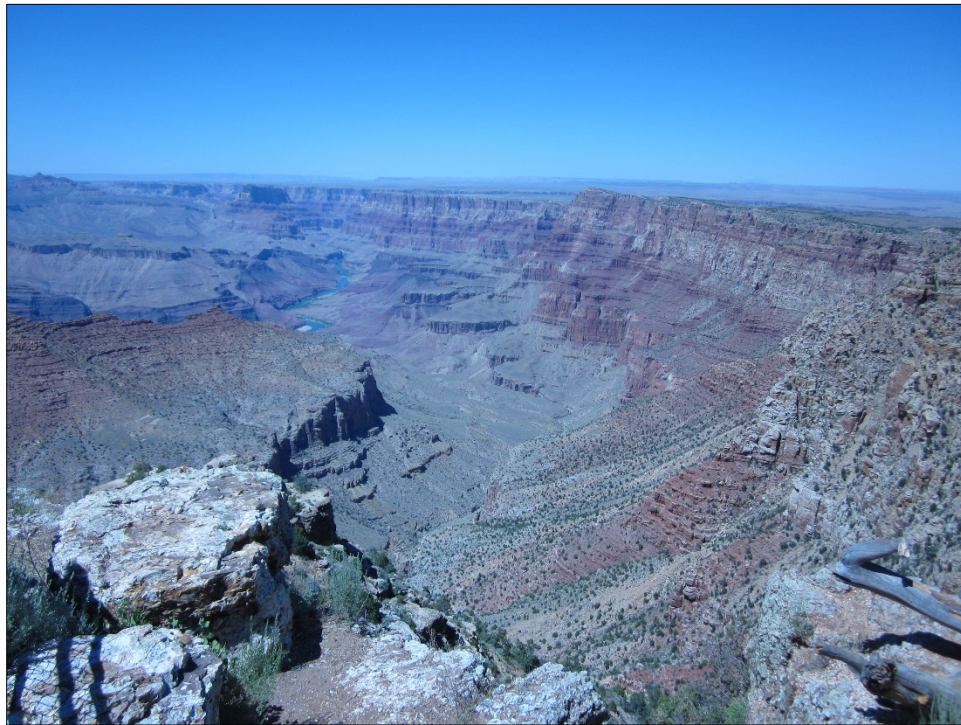
Figure 1. Navajo Point on the South Rim.

Our first view of the canyon was breathtaking.