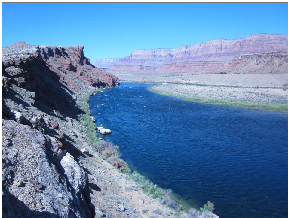
Figure 3. Colorado River from Lee's Ferry.