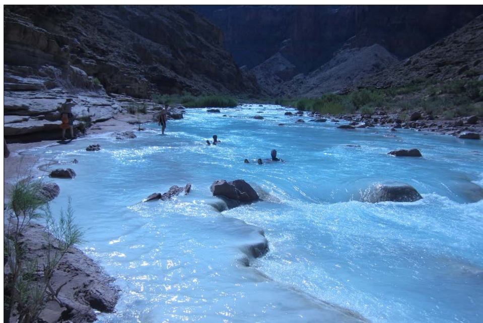
Figure 7. Floating the Little Colorado River with life vests on our hips.

Today we stopped at the confluence of the Colorado River and one of its tributaries, the Little Colorado River. I was struck by the beautiful light-blue color of the Little Colorado. It looked like a tropical paradise. Excessive calcium turns the water light blue.