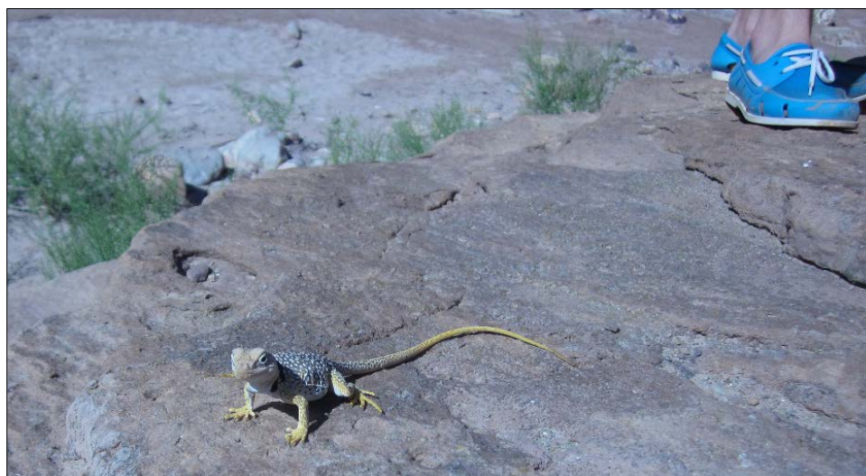
Figure 8. Western collared lizard and cool blue shoes.