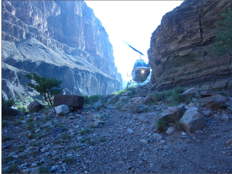
Figure 17. Helicopter arriving to extract the boaters from the canyon.

All good things must come to an end. Time to hike out of the canyon with all our gear. Nah, we'll take a chopper instead. Back to civilization!