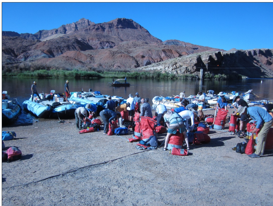
Figure 2. Packing our gear in dry bags at the boat launch.

Let the adventure begin! Time to say goodbye to cell service, internet, and air-conditioning for the next week.