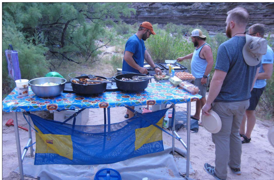
Figure 12. One of many delicious meals prepared by the boatmen. Today's breakfast: eggs to order, sausage, English muffins, fresh fruit, and yogurt. Food just tastes better outdoors.