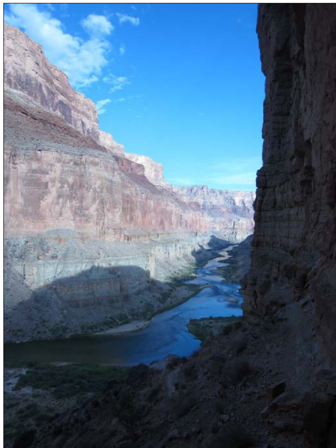
Figure 6. Colorado River from the Nankoweap granaries

Have you ever wondered how marine fossils got placed thousands of feet above sea level on every continent, even on high mountains, such as the Himalayas and Mount Everest?