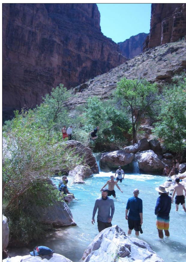
Figure 16. Playing in the light-blue waters of Havasu Creek. Note my airborne colleague ( center ).