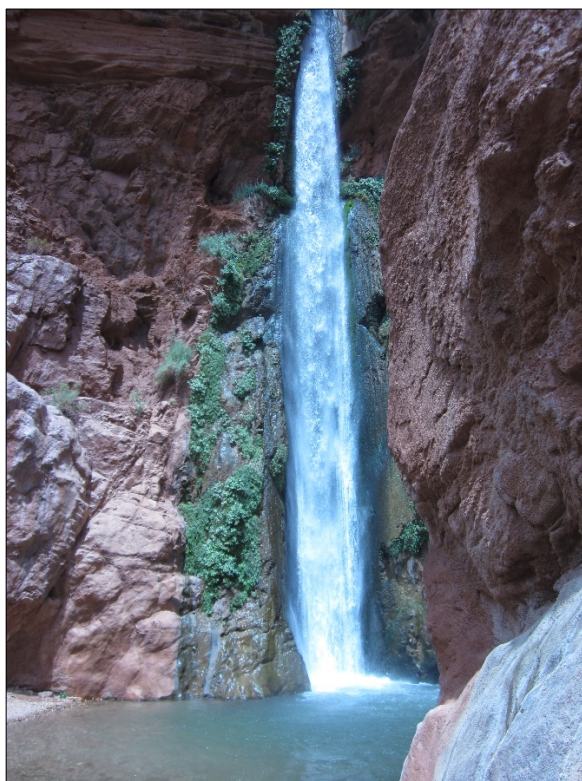
Figure 13. Deer Creek Falls.